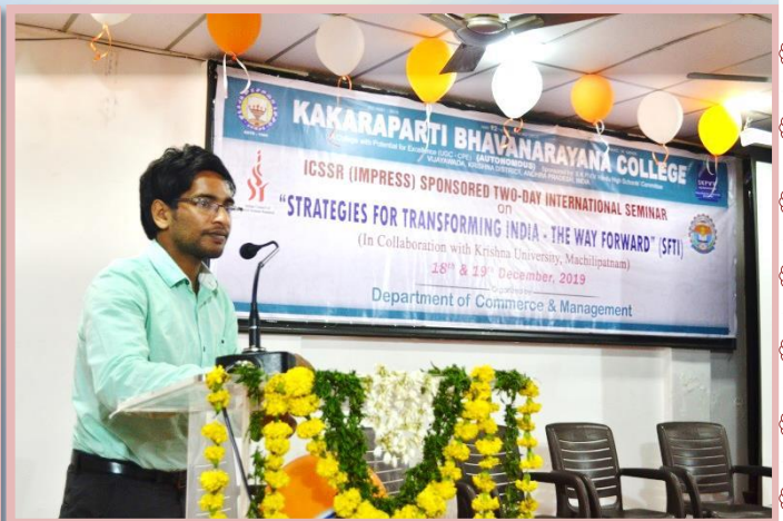
Paper Presentation by Participants