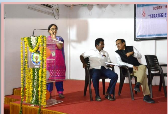
Paper presentation by Participants