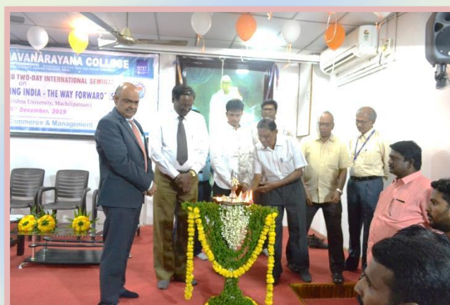
Lighting the Lamp