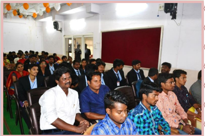
Participants at the Technical Session