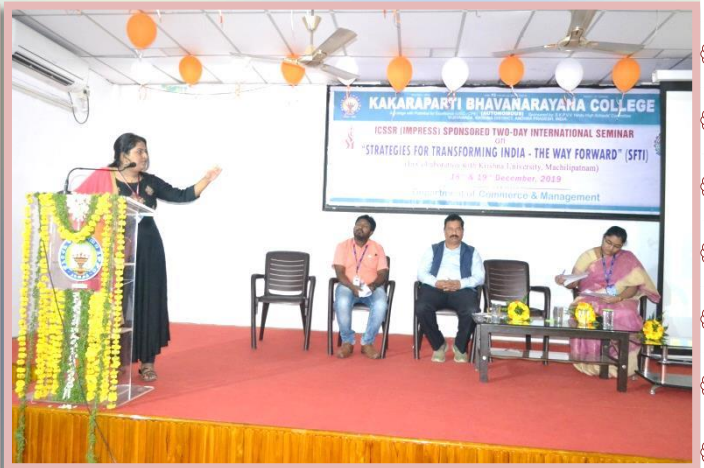
Paper presentation by Participants